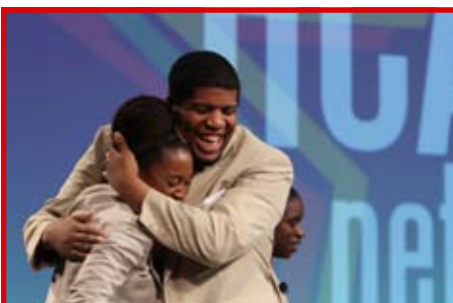
An emotional win for Oakwood earns the Ambassadors a slot in the Finals