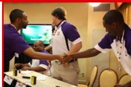
Win or lose, being a good sport is an important part of the HCASC experience