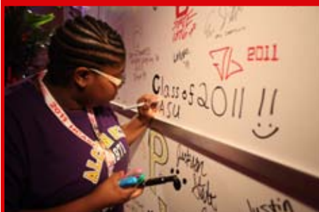
Students make their mark on the graffiti wall during Arrival Day