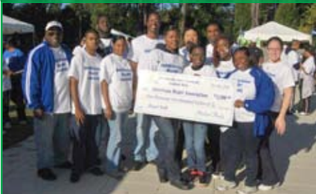
Fayetteville earned a $2,000 grant for the American Heart Association

Giving back was a focus of the HCASC program year and the HBCU service projects supported a wide range of charitable causes. In all, 70 schools completed projects across dozens of communities.