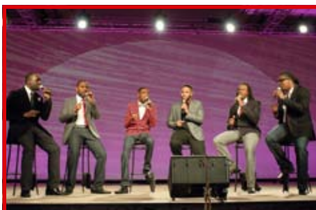
Vocal ensemble, Committed, wowed the closing banquet with their flawless harmonies