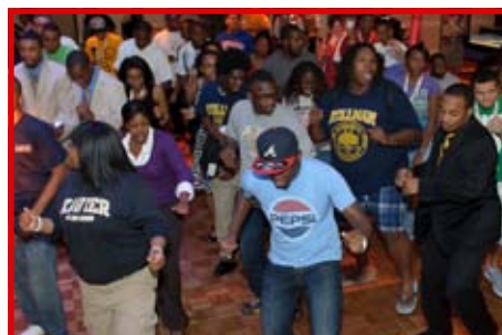
Students celebrated the return home by partying in the Honda Student Union