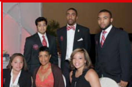
Delaware State is dressed to the nines at the Opening Banquet