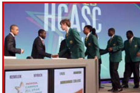
Kentucky State outscored Morehouse to advance to the Final Four