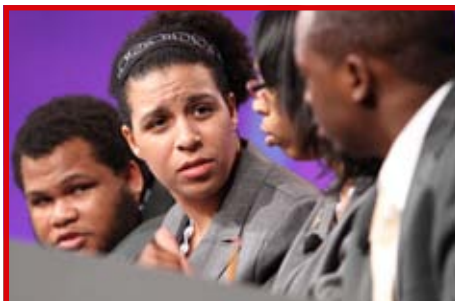
As part of the Elite Eight, Fisk University competed for a spot in the Semi Finals